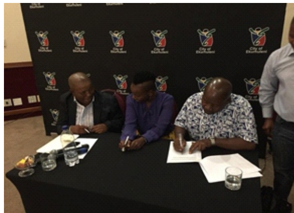
Ekurhuleni Taxi Industry and COE HOD for Transport Planning signing the agreement of affectedness

On Wednesday, 17th of January 2018, Taxi Industry Leaders and the City of Ekurhuleni Officials attended the working groups workshop held at the Glenburn Lodge and Spa. During the workshop, all participants focused on coming up with a criteria of affectedness for compensation during the roll out of the phase 1 of Harambee BRT full service.