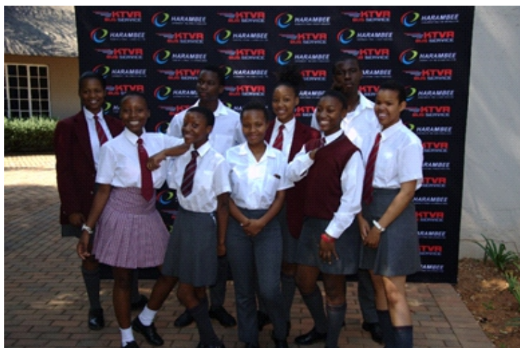
Zitikene High School