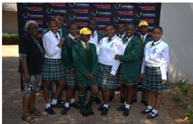
Tembisa Secondary High School