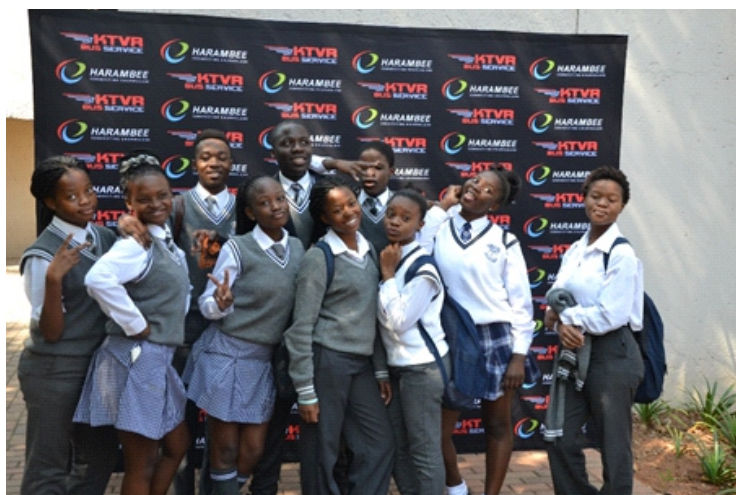
Tembisa West High School