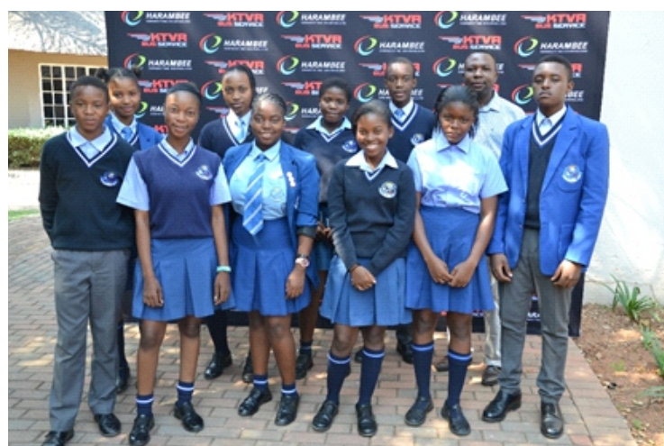
Phomolong High School