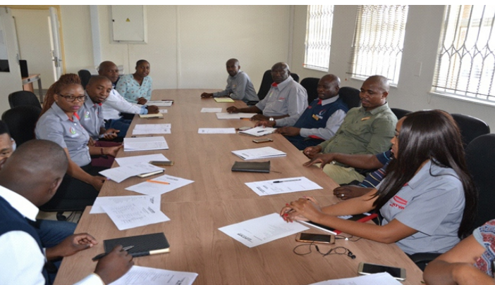
Operations Team in a Meeting

For any queries with regard to the schedule of buses, customers are encouraged to contact our bus depot at 011 493 8646 between office hours and they will be directed to the relevant office to resolve their query