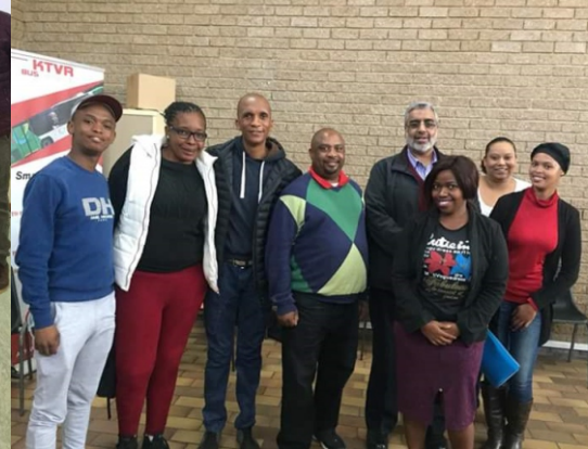
Workshops held across Tembisa, Reiger-Park and Boksburg