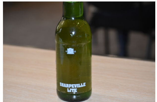
Sharpville Breweries looking for R10 million injection