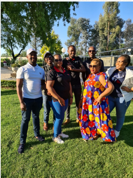
KTVR Finance Department