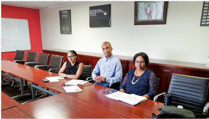
KTVR Public Relations Department