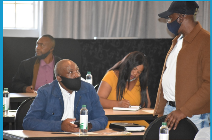
The Ekurhuleni Taxi Industry

On Monday, the 28th of September 2020, KTVR hosted the Ekurhuleni Taxi Industry Transformation Workshop. The aim of the workshop was to present value chain opportunities and other business opportunities to the taxi industry leadership of the affected taxi association in respect to the Harambee BRT project currently underway in the phase 1A and B from Tembisa to Isando and OR Tambo International Airport.