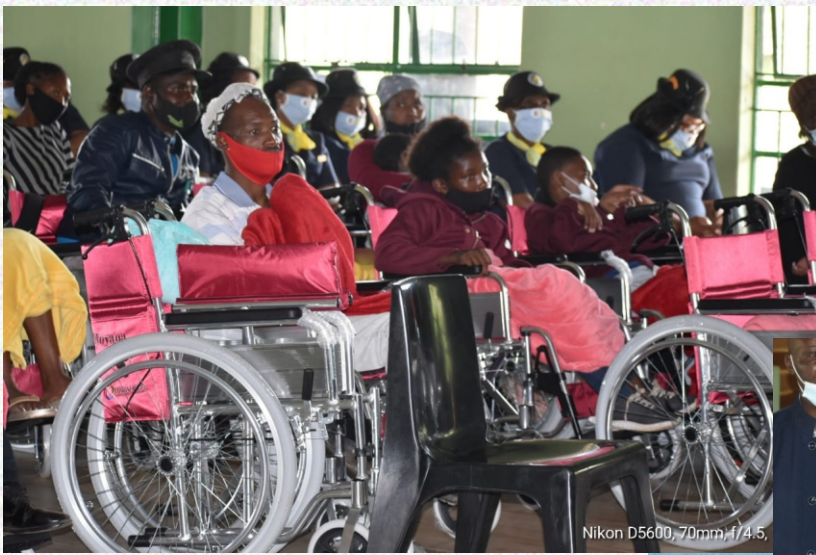
Nikon D5600, 70mm, f/4.5