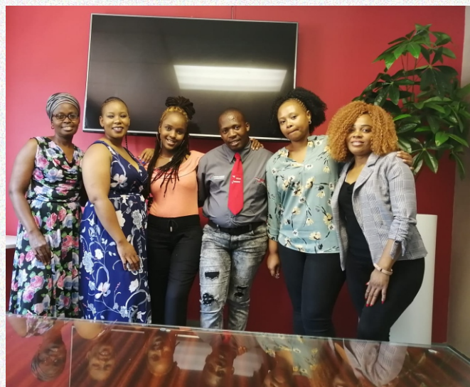
KTVR Office of the Executive Chair Department