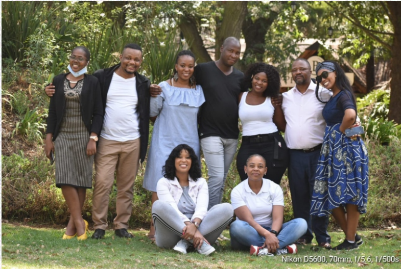
Nikon D5600, 70mm, f/5.6, 1/500s