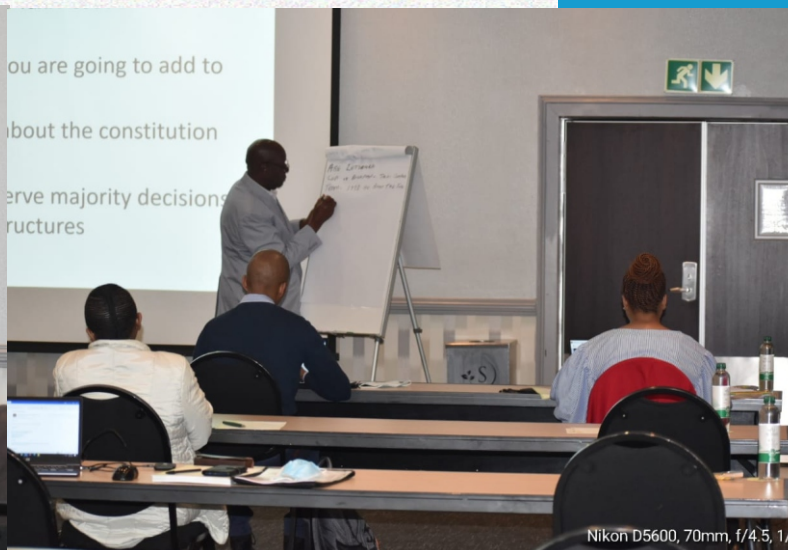
Nikon D5600, 70mm, f/4.5, 1/60s

With ongoing meetings between the Ekurhuleni Transport Industry and the City of Ekurhuleni, many strategic workshops were held in between to discuss and resolve any concerns from the affected operators on the interim compensation and affectedness of individual operators in line with the roll out of the Harambee BRT system.