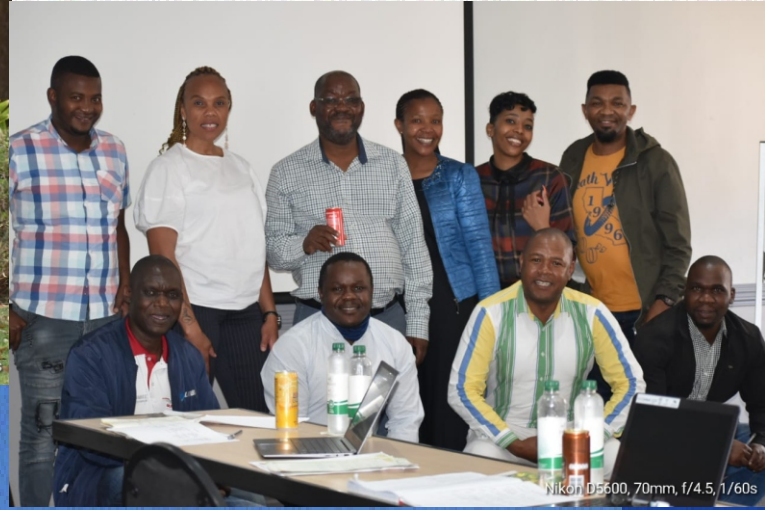
Nikon D5600, 70mm, f/4.5, 1/60s