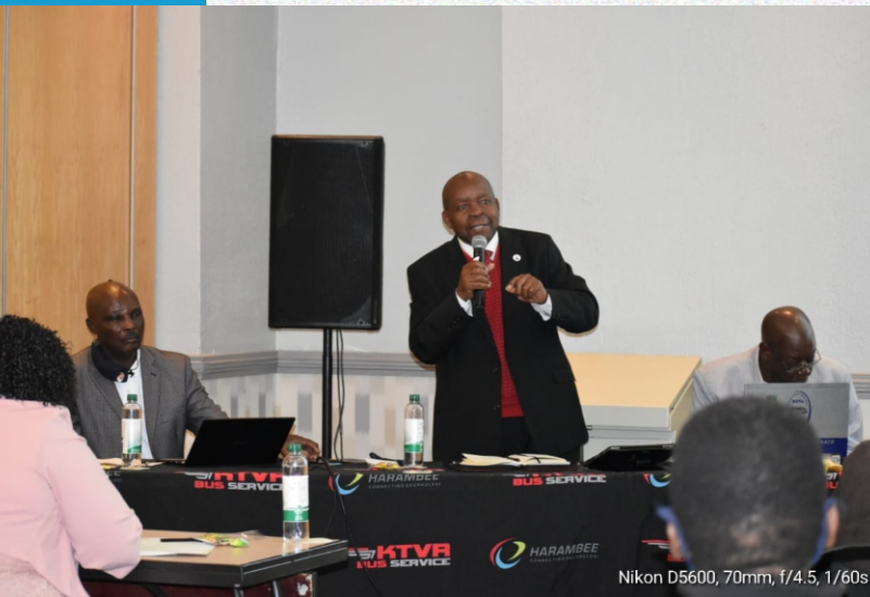
Nikon D5600, 70mm, f/4.5, 1/60s